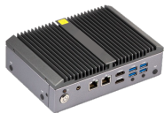
AI VMS Nano (4-8 Channels)