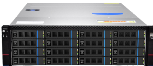
AI VMS 3U Rackmount (32 - 96 Channels)