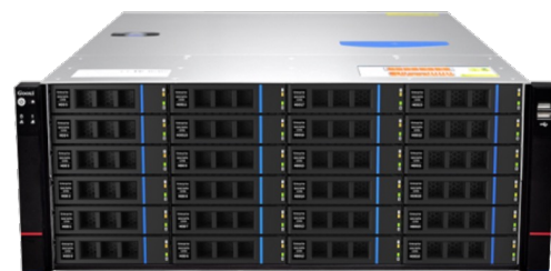
AI VMS 4U Rackmount JBOD (3.5" HDD over 60+pcs) (64 - 96+ Channels)