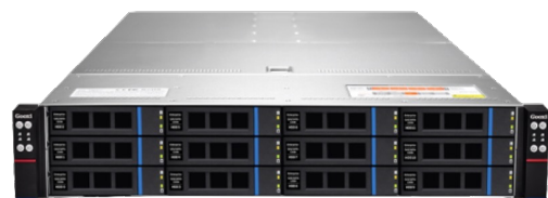
AI VMS 2U Rackmount (12 - 96 Channels)