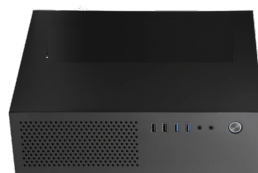
AI VMS Mini ( up to 16 Channels)